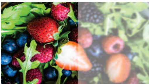
Viewed through material with low haze