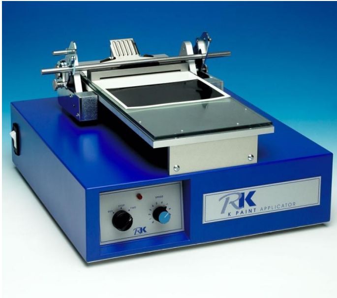
THE K PAINT APPLICATOR

Used for the application of paints to produce highly accurate and repeatable coatings in an instant. The machine uses gap applicators to coat onto paint test charts, steel panels and many other substrates. This may then be used for many applications including quality control – weather testing, opacity and other standard tests such as colour matching and customer presentation samples.