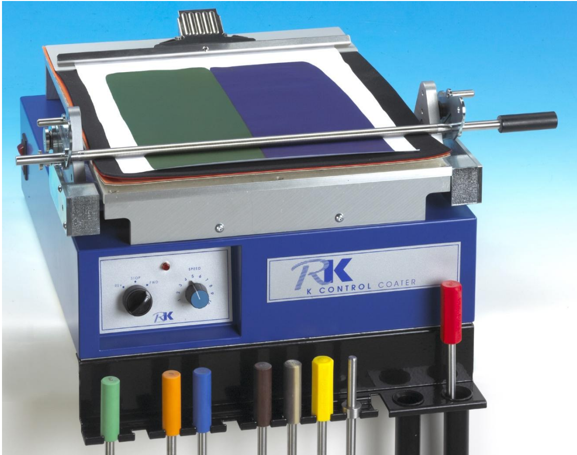
Above: K control Coater model 202. Below: K Control Coater model 101.